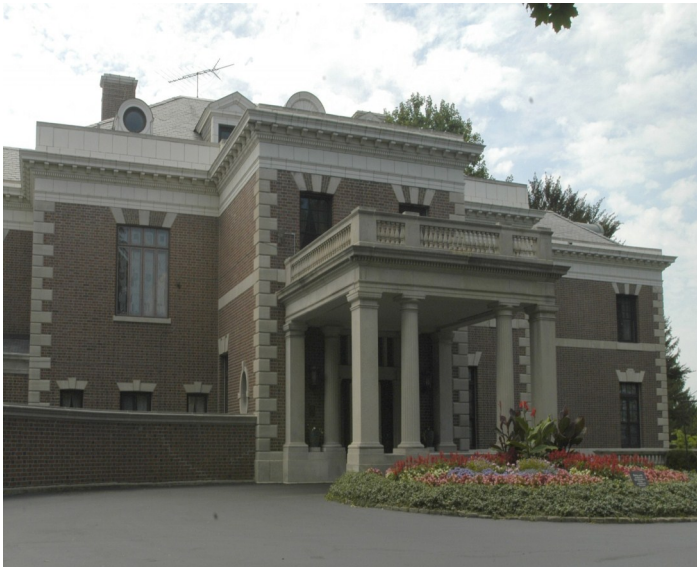
House of Prayer