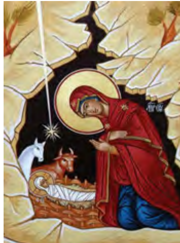
E. She Will Bring Forth A Son 10 cards - $12.95