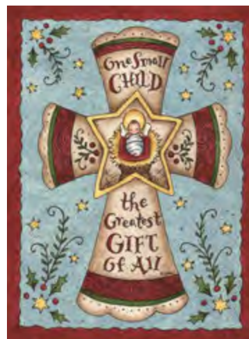
H. One Special Child 18 cards - $14.00 (Right)