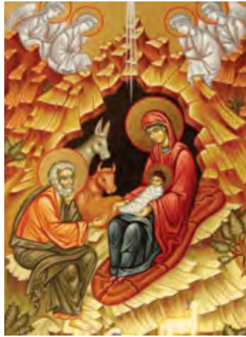
D. Nativity Detail 10 cards - $14.00