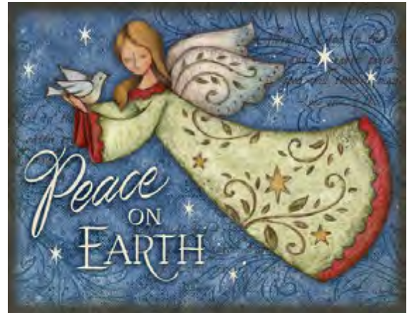
G. Peace on Earth 18 cards - $14.00