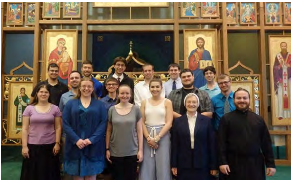
The Sisters of St. Basil hosted another successful Young Adult Retreat, June 22-24. Here is a photo of the group complete with big, bright smiles. The 2019 retreat is scheduled for June 21-23. Visit www.sistersofstbasil.org for further information.

have been touched by personal contact with these Sister Jubilarians. For all of these Sisters, and for the giftedness with which the community has been enriched and blessed, it was with heartfelt gratitude, that "God grant them many years" was sung as we joined together for a celebratory meal following the Divine Liturgy.