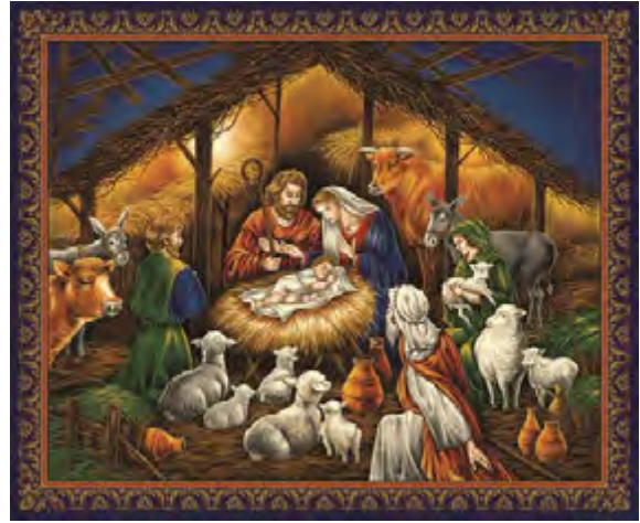
F. Star of Bethlehem 10 cards - $14.00