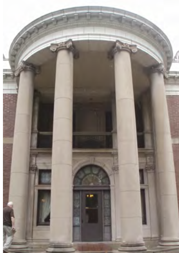
House of Prayer