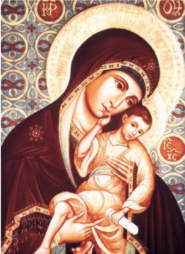
Theotokos, Steadfast Foundation of Faith

The weekend weather forecast was not promising, but Labor Day weekend turned out to be a lovely weather weekend for the 79th Annual Pilgrimage in Honor of Our Lady of Perpetual Help, August 31 & September 1.