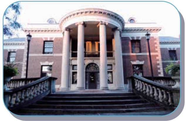
House of Prayer - Mount Saint Macrina